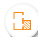
Real Estate Optimization