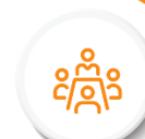
Conference Room Reservations